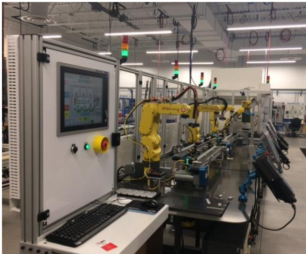
Figure 5: This Flexible Manufacturing System at Chippewa Valley Technical College in Eau Claire, Wisconsin, was designed to deliver IIoT and Industry 4.0 learning.

The system is literally a fully functional manufacturing system which machines, engraves and assembles a made-to-order, custom USB Flash Drive. It includes four robots identical to those most widely used in industry and the same machining center used in the manufacture of the Apple iPhone enclosure.