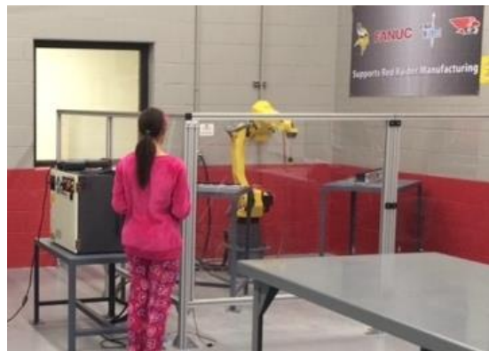
Figure 2: A student at Sheboygan, Wisconsin’s South High School operates an industrial grade FANUC robot as part of the school’s Red Raider Manufacturing program.