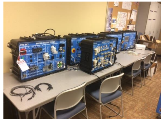
Figure 3: Hands-on Industrial Skills-Based Training Systems used to deliver industry-relevant authentic learning

Base manufacturing skills training when combined with computer science and networking knowledge provides an ideal springboard into project-based learning opportunities that can continue to build Industry 4.0 skills. For instance, the design and manufacture of a water desalination system, ergonomic manipulator, automated drawbridge, automated can crusher or a hovercraft. Projects of these sort that build valuable design, collaboration, problem-solving and system fabrication skills would all be appropriate at the secondary level.