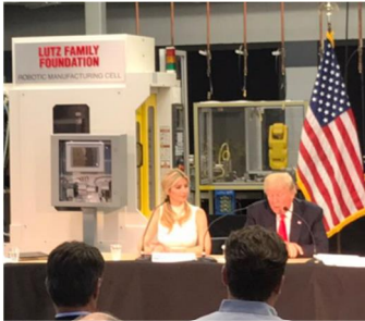
Figure 4: President Donald Trump and daughter Ivanka pictured before a Mechatronics Learning System at Waukesha County Technical College in Waukesha, WI.

Imperative in the design of such a system is the presence of IIoT technology and the curriculum to support it. For instance, one such system integrates barcoding, radio frequency identification, machine vision, a smart stack light and smart proximity, pressure and positioning sensors into its system. To